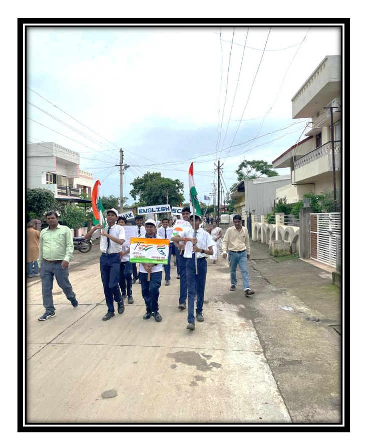
13 August 2022 - Celebrated azadi ka amrit mahotsav