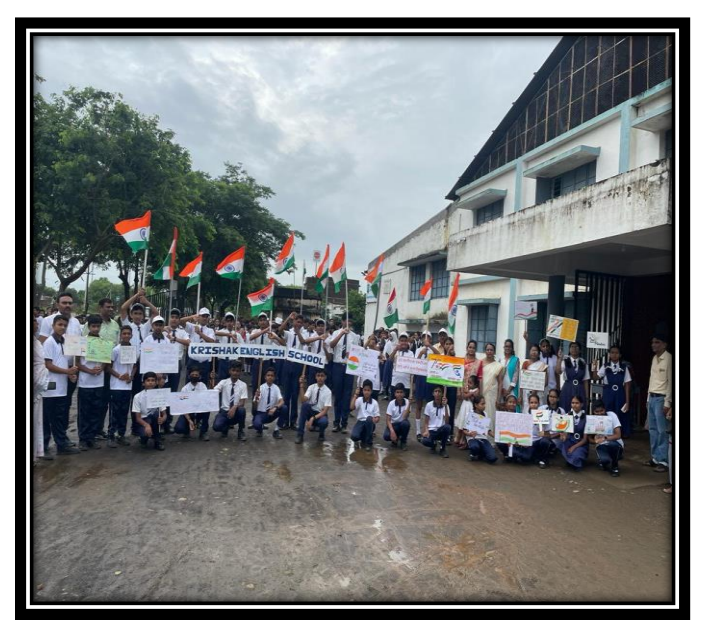
14 August 2022 azadi ka amrit mahotsav rally